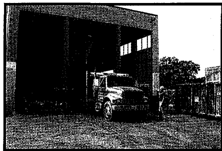
NEW! Recycling Station

Let Disposal Management Systems recycle your refuse and construction debris. We have roll-off containers in sizes for every need, and we recycle most materials at our recycling center.