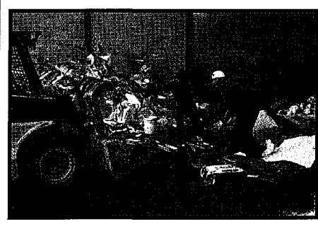
Sorting & Recycling